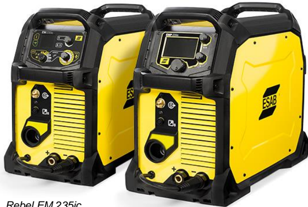
Rebel EM 235ic